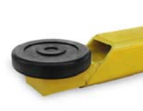
Rubber Contact Pads