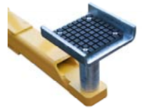
Frame Cradle Pads