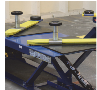
Optional Arm Kit